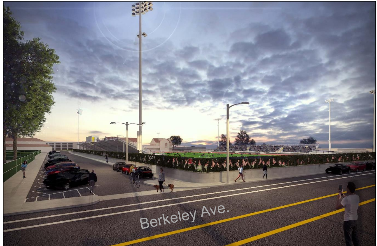
Rendering of Lighting Stanchions at Driveway 2