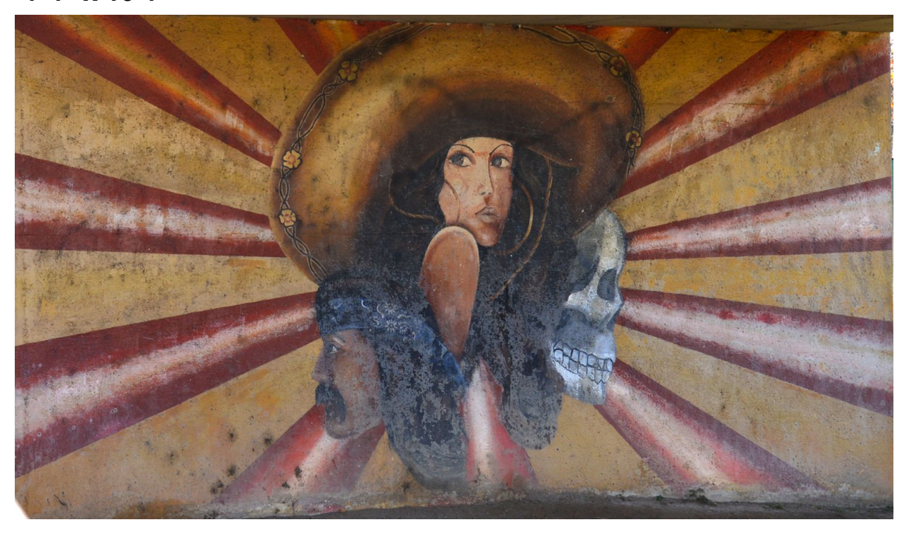
$3,000 Artist(s). Materials $250

This mural has Oxidation of the protective layer. Minor chipping and peeling. Holes in the concrete wall. Able to restore by prepping and painting the current mural. Recommendation: