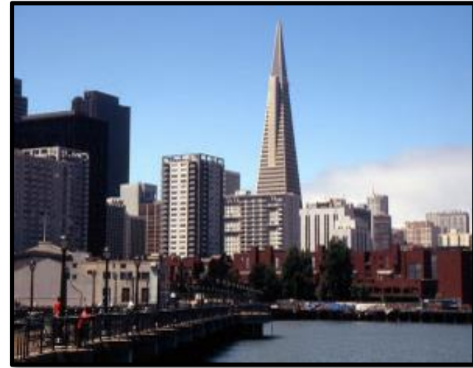
Transamerica Tower San Francisco, 1972