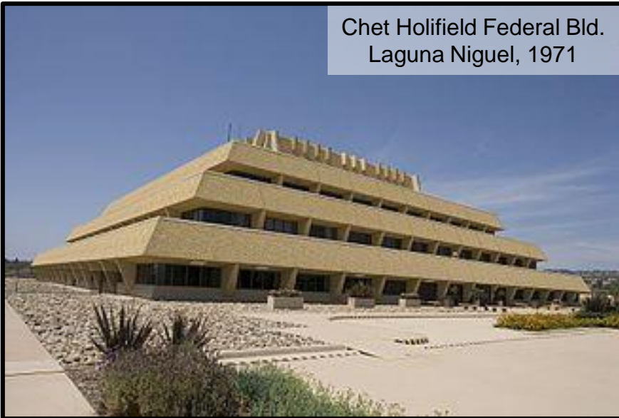
Chet Holifield Federal Bld. Laguna Niguel, 1971