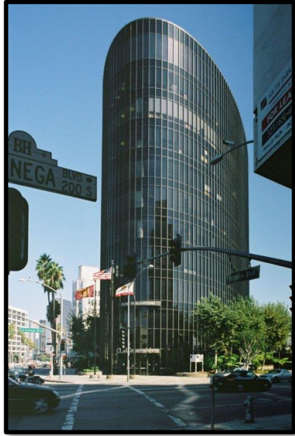
Great Western Savings Beverly Hills, 1972