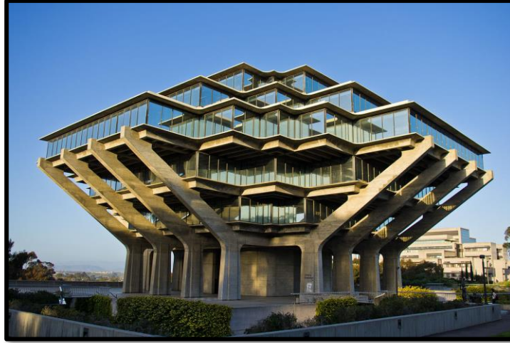
Geisel Library, UCSD, 1970