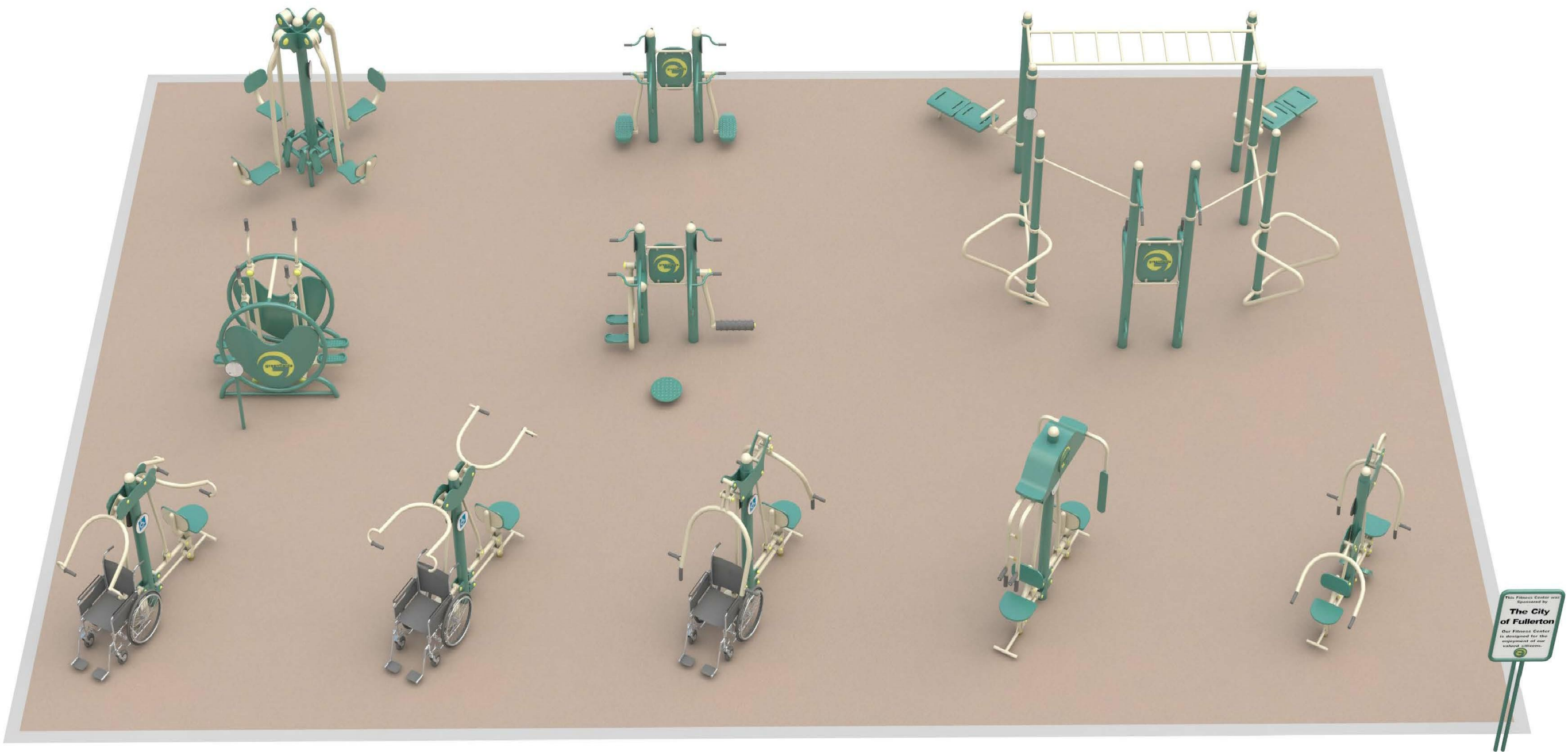
CONSOLIDATED EXERCISE EQUIPMENT STATIONS

NOTE: CONCEPTUAL DESIGN BASED ON NON-SURVEYED AERIAL MAPPING.