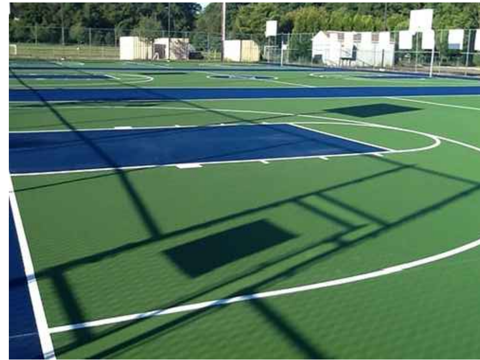
BASKETBALL (HALF COURT)