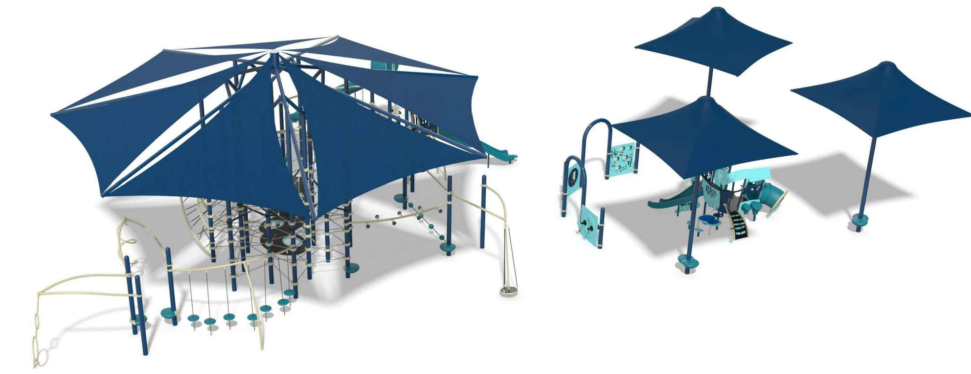
PROPOSED PLAYGROUND EQUIPMENT