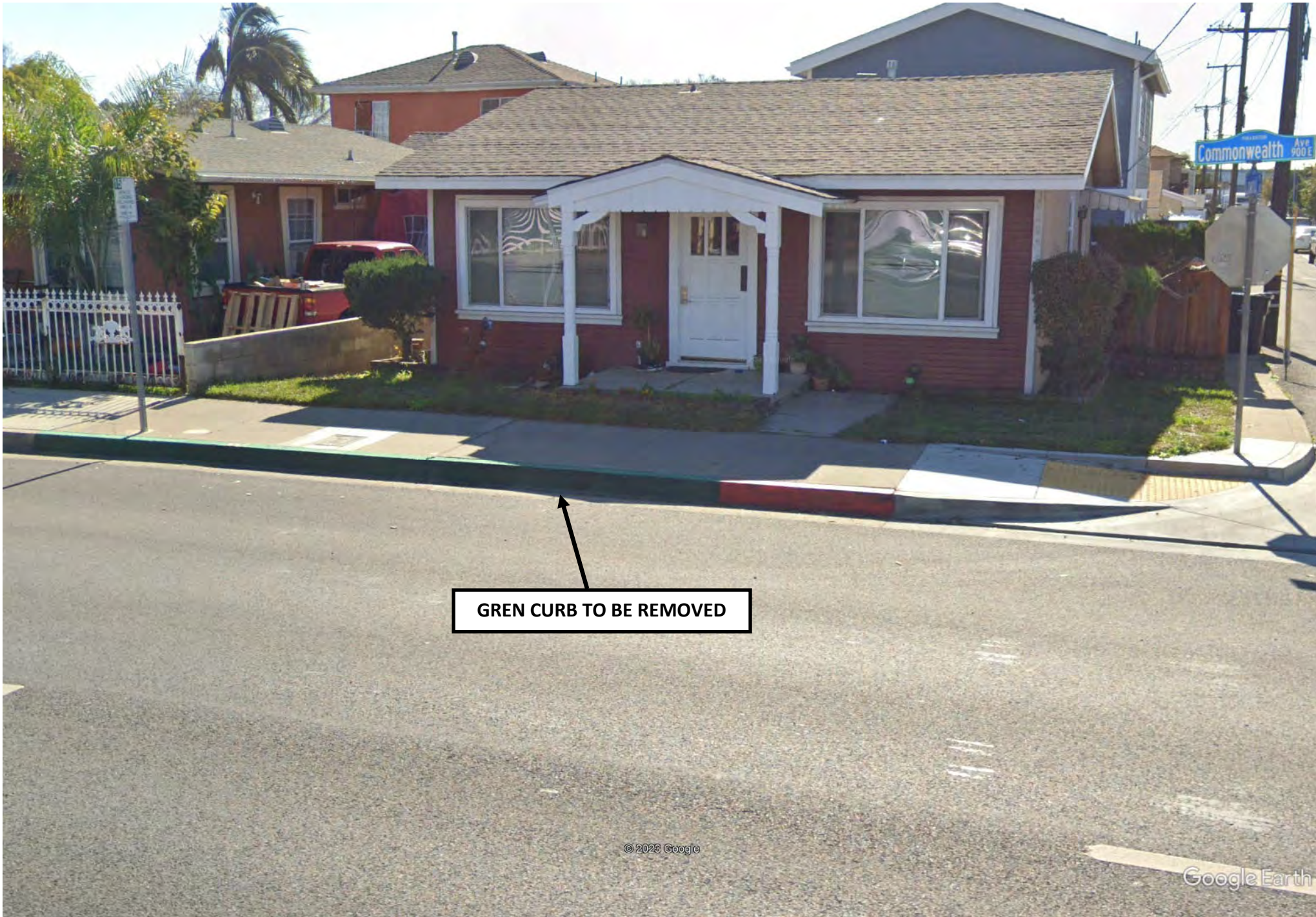
912 E. COMMONWEALTH AVENUE Remove Green Curb - Street View