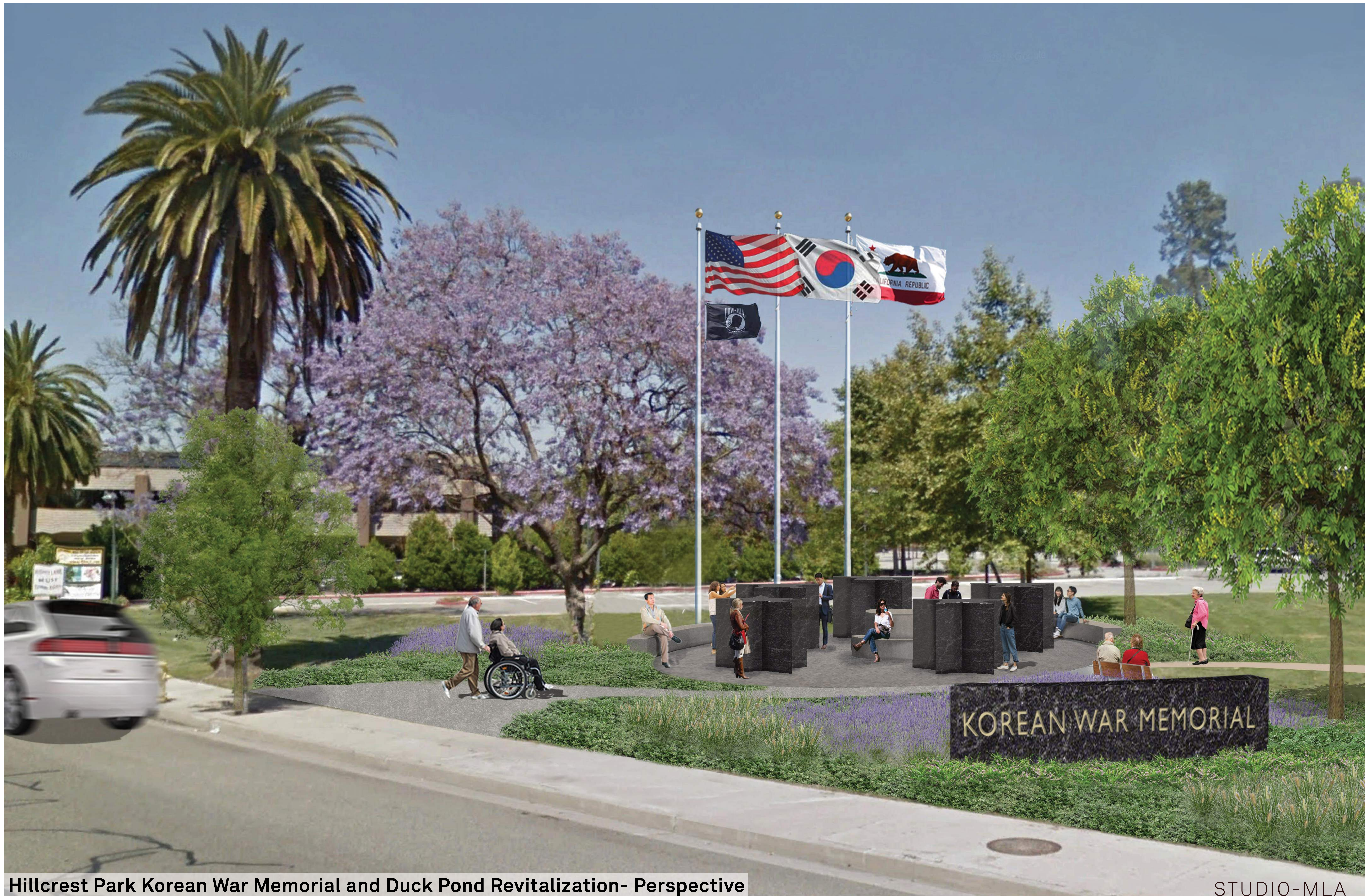
Hillcrest Park Korean War Memorial and Duck Pond Revitalization- Perspective